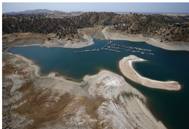
California is four years into a severe drought, putting reservoirs like Millerton Lake near Friant, Calif., at record-low levels.

Neither desalination nor wastewater recycling is new to California. One of the state's first large desalination plants was built in Santa Barbara in 1991 in response to the region's last major drought, but it only made it into a testing phase before being decommissioned when rains returned. Now the city plans to update it and put it back in service, at a cost of $40 million. Meanwhile San Diego County is building a new desalination plant in Carlsbad for $1 billion. When it opens in late 2015, it will provide 50 million gallons of water a day to the county, making it the largest in the United States. As for wastewater recycling, the largest plant of its kind in the world is the Orange County Water District's Groundwater Replenishment System, which treats sewage wastewater to replenish inland and coastal aquifers. In service since 2008, it can produce 70 million gallons of treated water per day; the water district is now spending $143 million to expand it